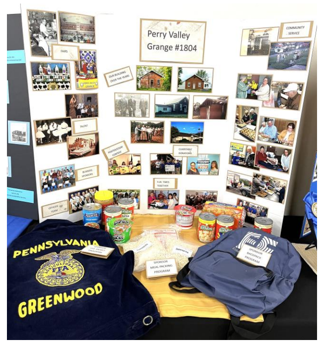
Our tabletop display at State Grange shared the history and activities of Perry Valley Grange.

Perry Valley had six representatives attend the annual session of the PA State Grange held Oct. 18-22 in Morgantown when 150 years of service was celebrated.